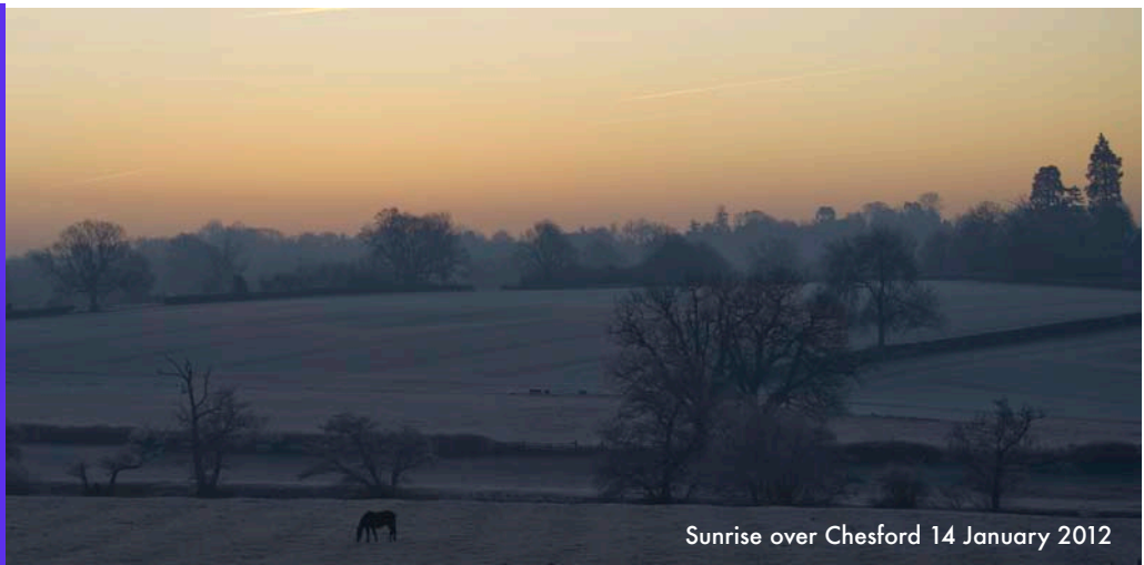
Sunrise over Chesford 14 January 2012

Dial this number where there is danger to life or property or a crime is being