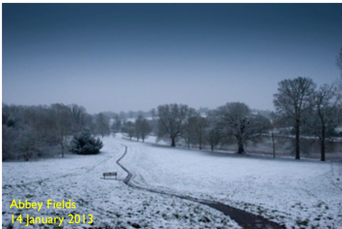
Abbey Fields 14 January 2013

Follow Kenilworth SNT at: @SNT_Kenilworth